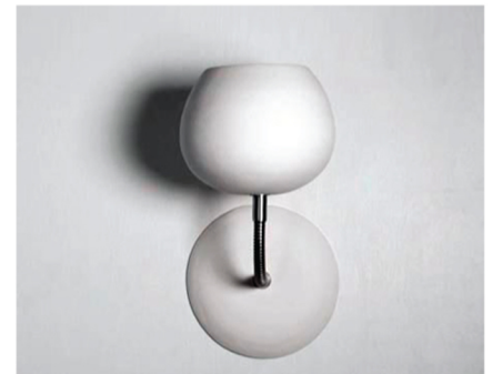
Day light image