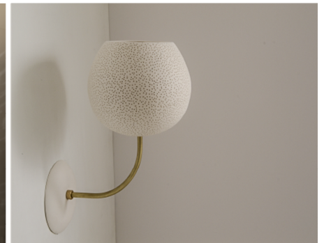
Day light image